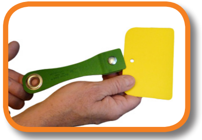
• For quick change of spreaders for cleaning, insert spreader in front of bolt and tighten.