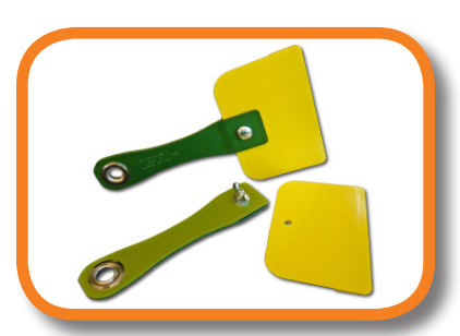
• Wing nut can be installed through the spreader for heay duty tasks and extra secure usage.